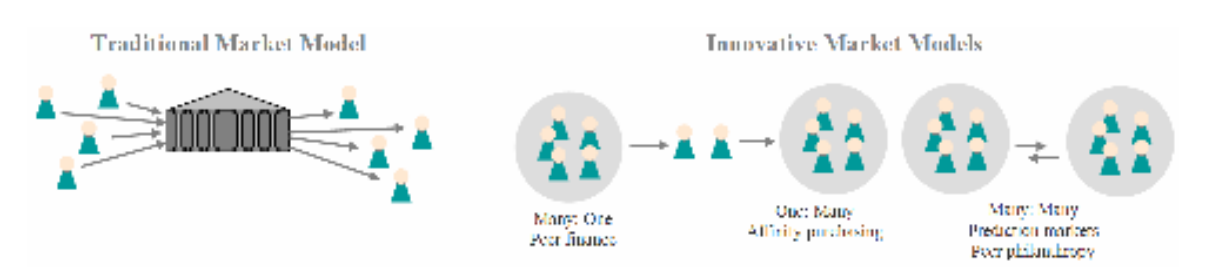
Figure 3. Traditional and innovative market models in economics and finance.

The fifth important concept in the economy 2.0 is the evolving role of financial institutions. The traditional market model was one central institution serving many individuals. This was large-scale, impersonal, and uncustomized. Now innovative new market models are starting to emerge with one-to-one and many-to-many relationships (Figure 3). One example is the advent of payment network alternatives like PayPal and cell phone networks. In the cell phone example, a prepaid card may be purchased in one city and the access code given to a family member in a rural area who can then use the minutes as credit or currency.